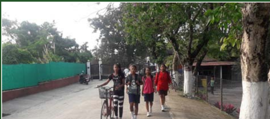
Neighborhood children coming to play

School has opened its playing facilities to some neighbourhood schools for a time slot from 4 pm to 5 pm for cricket, volleyball, table tennis for which schools coaches are available. This is a free initiative of the school as per its neighborhood social commitment