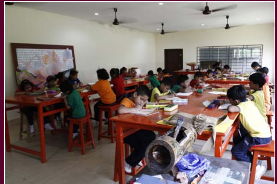
Outdoor Art & Craft Activities