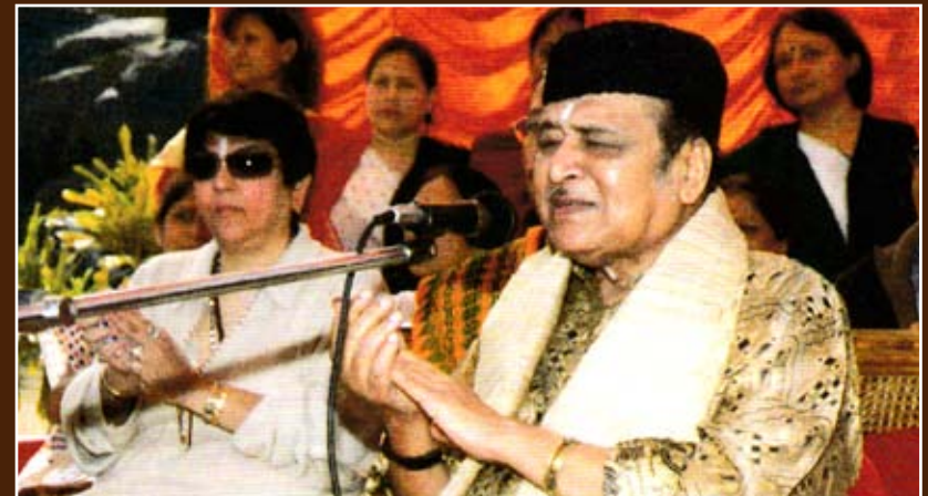
Dr. Bhupen Hazarika saying a few words. Ms Kalpana Lazmi, reputed film maker is seen on his right.