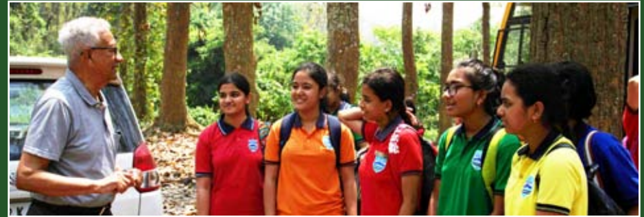
Students on arrival at the project site for Elephant Rest Area being briefed

The school has taken up a project to create Elephant Rest Areas (ERAs) in a elephant human conflict zone at the foot hills of Karbi Hills (nearly 180 km away from school) by planting 15000 banana plant (Bhimkol) under the umbrella of an NGO,- Green Guard Nature Organisation. It will be a continuing project. The students of the Environmental Club has actively participated in the plantation at the location.