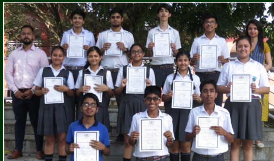
2018 delegation, -the best school delegation

In this year's conclave (2018), the school sent a delegation of 15 students for participation in the Model United Nations Conference under the aegis of Polaris Solution Enterprise, Shillong, held on 1st-3rd June 2018, with the theme "Coadunate Contra Conflict : Enunciate Towards Congnizance". Many schools from India and a few delegates from abroad, participated in the conclave. The FHSS delegates outshined in the conference as 13 out of 15 delegates got recognition for their outstanding performance in respective committees enabling the school to bag the best school Delegation.