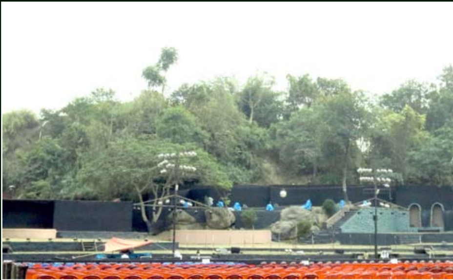
Stages transformed during functions