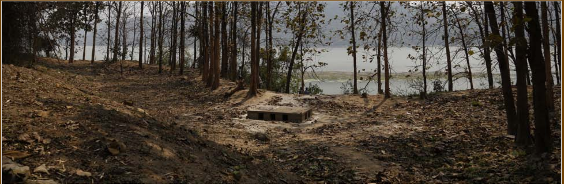
School's own idyllic picnic spot within the school campus