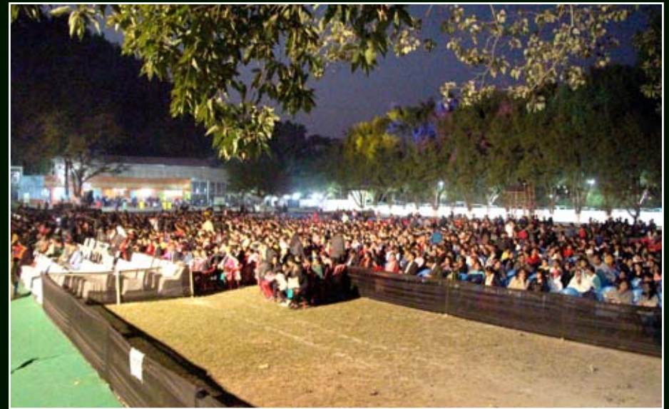
Audience during open air stage function