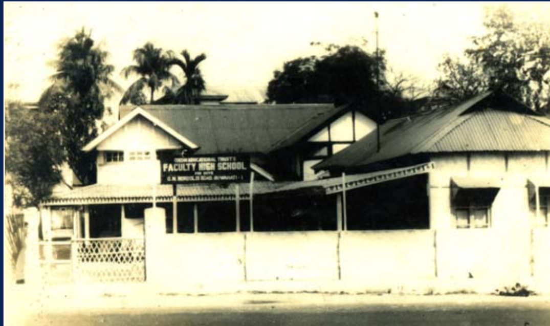
Where it all started in 1982