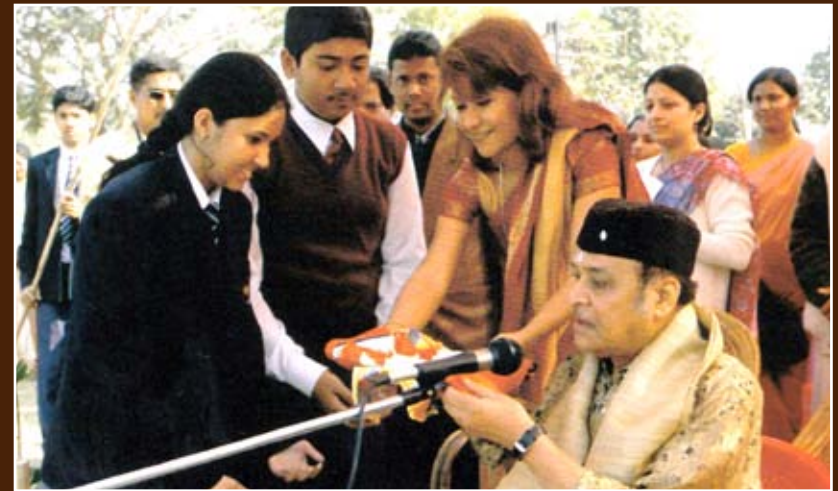
Dr. Bhupen Hazarika being felicitated by principal and the school captain