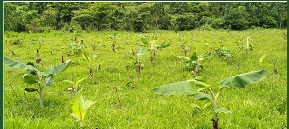
Banana trees as planted growing up end Jun, '18

There are other activities of the Environmental club as well