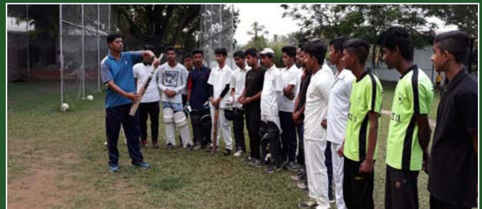
Neighborhood youngstars receiving coaching