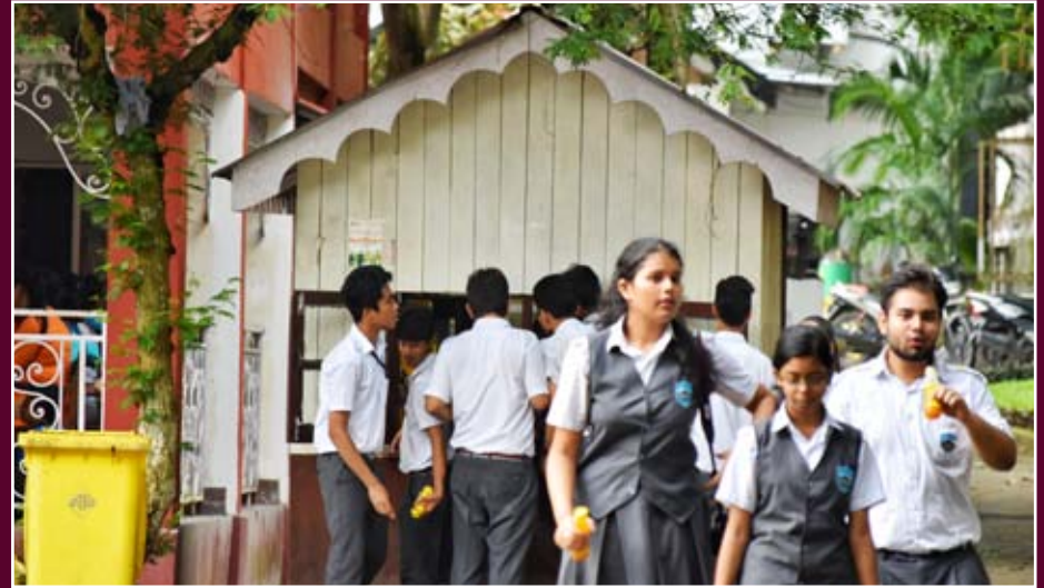
A sub canteen