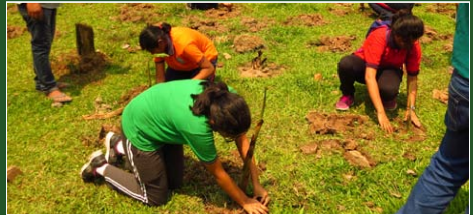
Students planting banana saplings on April, '18

There are other activities of the Environmental club as well