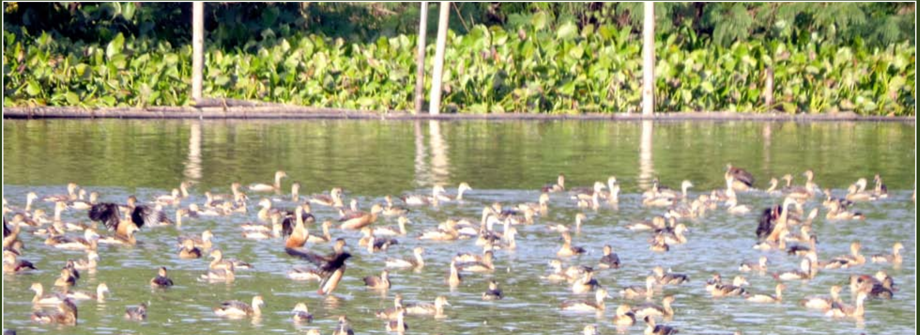
Whistling Teals and other migratory birds